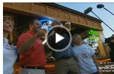
Beer tent owner claims Obama stop cost him $...