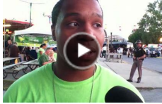
Iowa State Fair 2012: Janitor reacts to Obam...