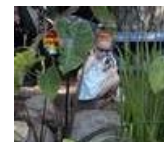
2012 Iowa State Fair Day 6