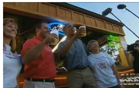
Beer tent owner claims Obama stop cost him $25K