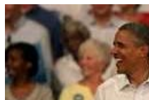
Obama Tours Iowa (Day 2)