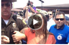
Paul Ryan hecklers pushed off stage at low...